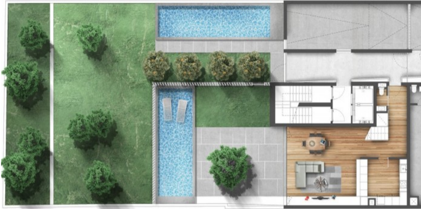
T3 Duplex - Ground Floor